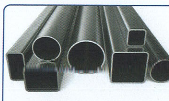
ERW MS PIPES AND GP PIPES